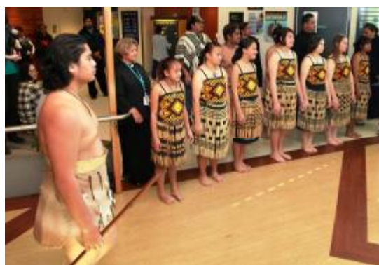
The haka powhiri group from Hillary Collegiate