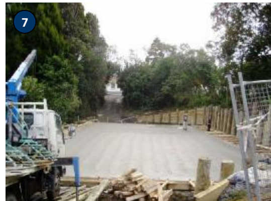
The foundation for the new building 19 is being laid.