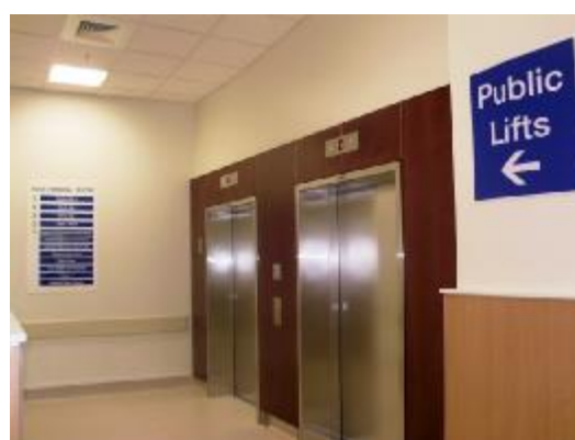
New Public Lifts

The old public lifts will now be decommissioned and removed. In their place, on Levels 1-5 will be new whanau/meeting rooms and public toilets.