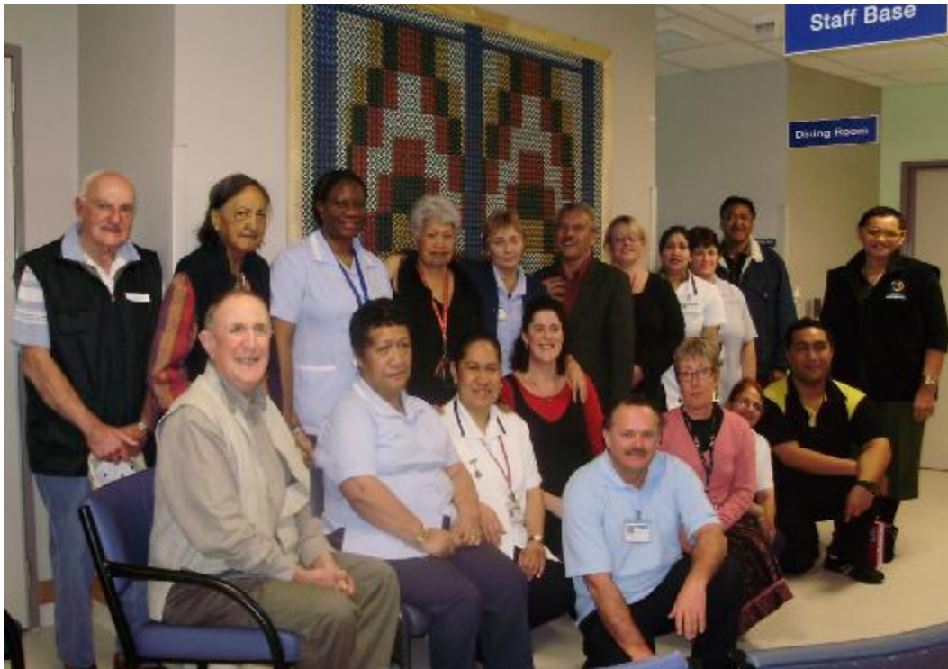
Staff and patients took part in the celebration

Staff and patients from Ward 35 came together to bless and celebrate the new name of their ward “Koropiko” and unveil the new tuku tuku panel that stands proudly in the main lobby.