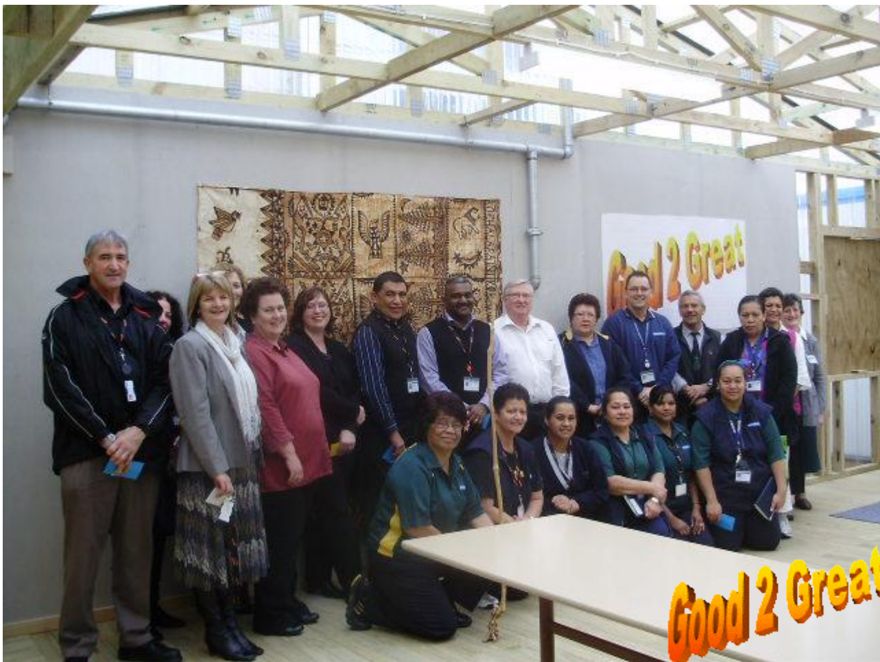
Non Clinical Support Staff gather for a blessing of their new area

Non Clinical Support Services (Orderlies and Cleaners) came together to bless and celebrate the opening of their new compound.