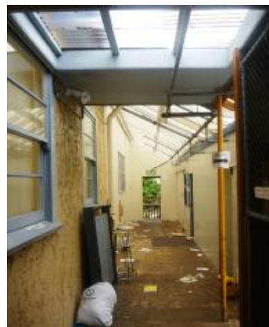
The old orderlies portacom (above) and the cleaners area below are now deserted

Access to Non Clinical Support Services (Orderlies and Cleaners) is via the old cardiac corridor – the same corridor as parking and security.