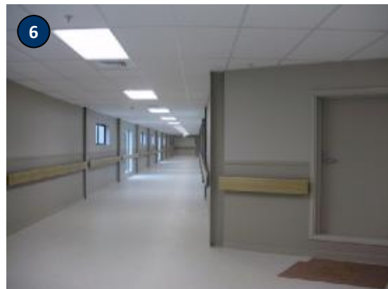
The new corridor between Edmund Hillary Building and Building 7 is now open. This will replace a section of the Rainbow Corridor