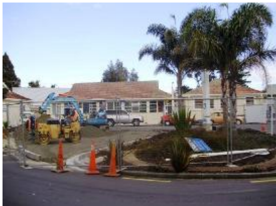
The Kidz First round-about is being reconfigured