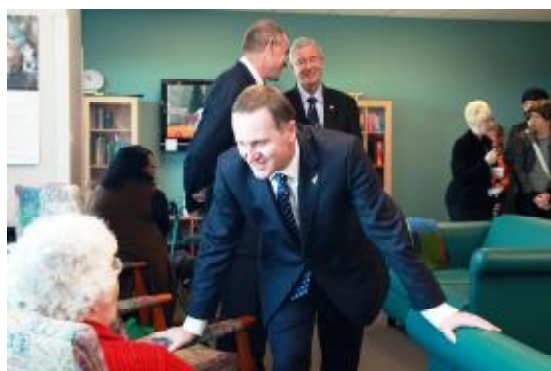
Hon John Key talks with a patient on Ward 35 Koropiko