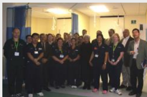
Staff from EC gather for the Blessing

The additional monitoring bays are helping to ease some of the demand on the assessment bays and are improving patient flow through the area