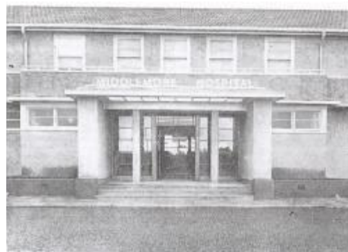
The front entrance of Middlemore Hospital 1947

A lot has changed over the years, however our culture and dedication to our patients remains.