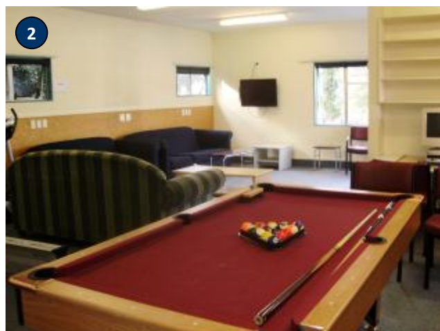
The RMO Lounge is now open