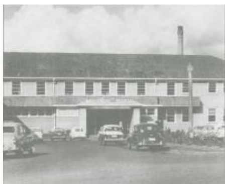
The front entrance of the Hospital - early 1950's

The hospital grounds were laid out and planted by Mr Arthur Farnell, the board's head gardener, who not only provided large expanses of grassed areas, flower gardens, rose beds etc. but an extensive tree-planted border of specimens he collected from his many botanical tramps around New Zealand.