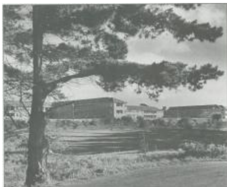
The completed Hospital - early 1950's

All buildings were timber framed, with pink stucco walls, white trim and orange coloured clay tiled roof. The hospital wing and accommodation blocks were two-storied with the ward bedrooms and verandahs being sited to make maximum utilisation of the sunlight, fresh air and park-like vistas.