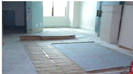
Vinyl being laid to a patient bedroom - 2nd Floor Manukau Surgery Centre