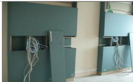
Wiring being installed - 2nd Floor Manukau Surgery Centre

The design closely resembles the surgical ward on the 1st floor of the Surgery Centre, with an emphasis on efficient patient/staff flows and effective use of clinical spaces.