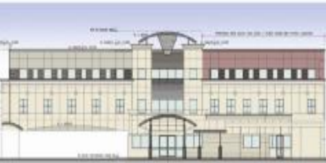
Exterior Graphic of the Acute Hub.

The increase in space also gives the Centre increased flexibility to accommodate future demands.