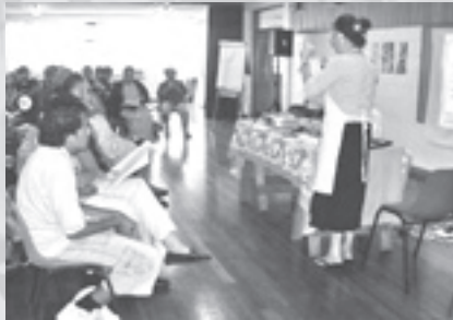
Attendees at a Community Nutrition workshop learn about the benefits of healthier food choices.

healthy eating to the community, in ways that are practical and specific to Pacific lifestyles. All participants receive a curriculum outlining information covered in the workshop, that's been developed by expert Pacific nutritionists and clinicians,